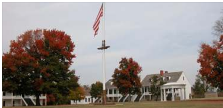
Fort Scott, Kansas

Fort Scott was named in honor of General Winfield Scott and established on May 30, 1842 at the Marmoton crossing of the Fort Leavenworth - Fort Gibson military road. It was among nine forts originally planned to line the area between the Great Lakes and New Orleans to separate proposed Indian lands and white settlements. Normal daily activities included the general construction of the fort and drill by Dragoons (horse soldiers). On occasion, map-making expeditions were made. The post was virtually abandoned in April 1853