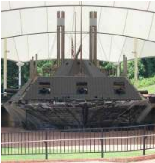
The USS Cairo today

The "city class" gunboats were designed by Samuel M. Pook and built by river engineer James B. Eads. Cairo was constructed at Mound City, Illinois, and commissioned in January 1862. The Cairo was destined to see only limited action in the engagement at Plum Point in May and in the battle of Memphis in June. Her most significant action came six months later when she kept a rendezvous with destiny.